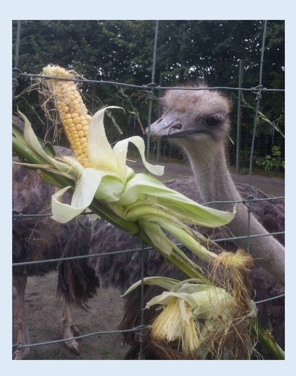
Corn exposed by ostrich