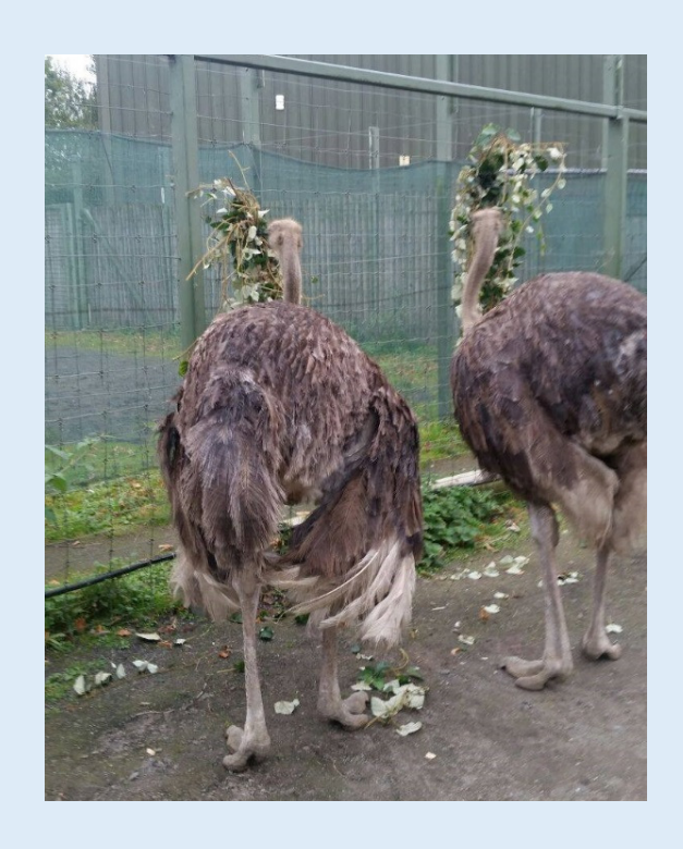
Rubus browse attached to fence line