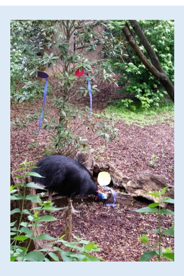
Balloon enrichment, painted cardboard and streamers