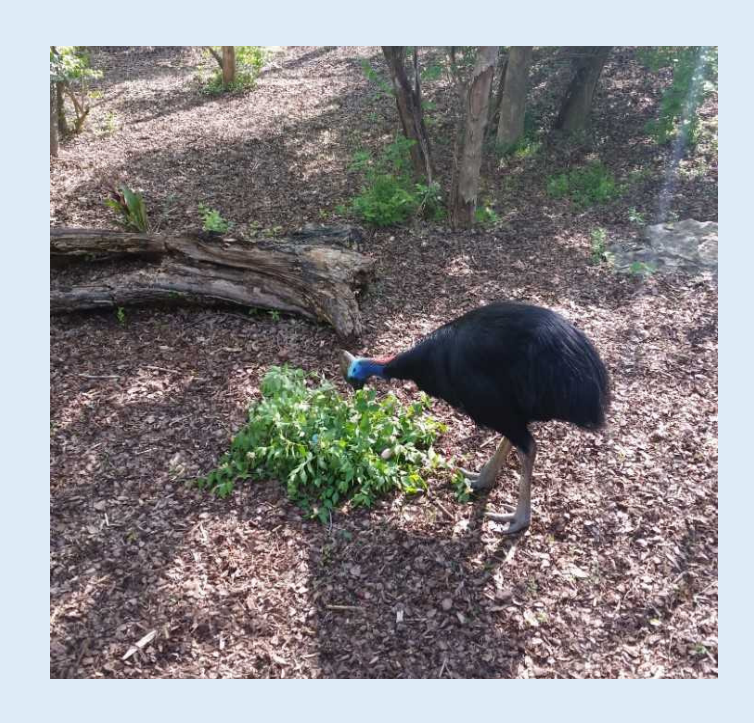
Browse pile with grapes and apples