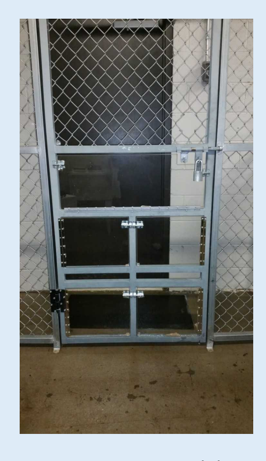
New Training panel doors

The Struthioniformes TAG does not take responsibility for enrichment use. Please evaluate enrichment safety at your facility