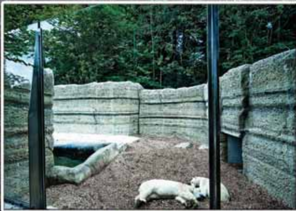
Polar Bear Enclosure, Hellabrunn Zoo Munich, Germany