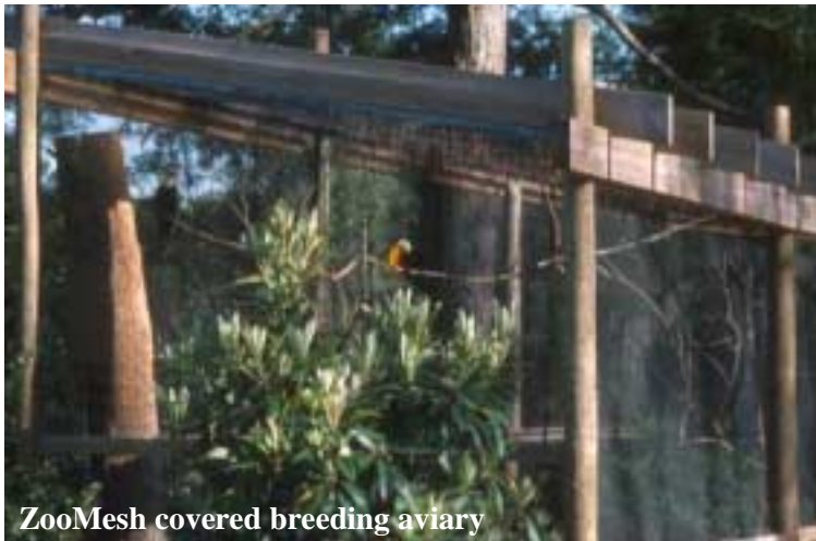
ZooMesh covered breeding aviary

During the breeding season, males of the large species may become quite aggressive towards the females. Vigorous bouts of “bill fencing” and chasing are common. If the male is particularly persistent, the female may need a “hide box” or heavily planted area where she can escape his attentions. We actually lost a breeding female Toco toucan to stress and physical injury inflicted by her mate in just such a situation. As with other types of birds, if the male comes into breeding condition prior to his mate, the female can be put at grave risk. There is a very fine line between normal “jousting” and potentially injurious pursuit.