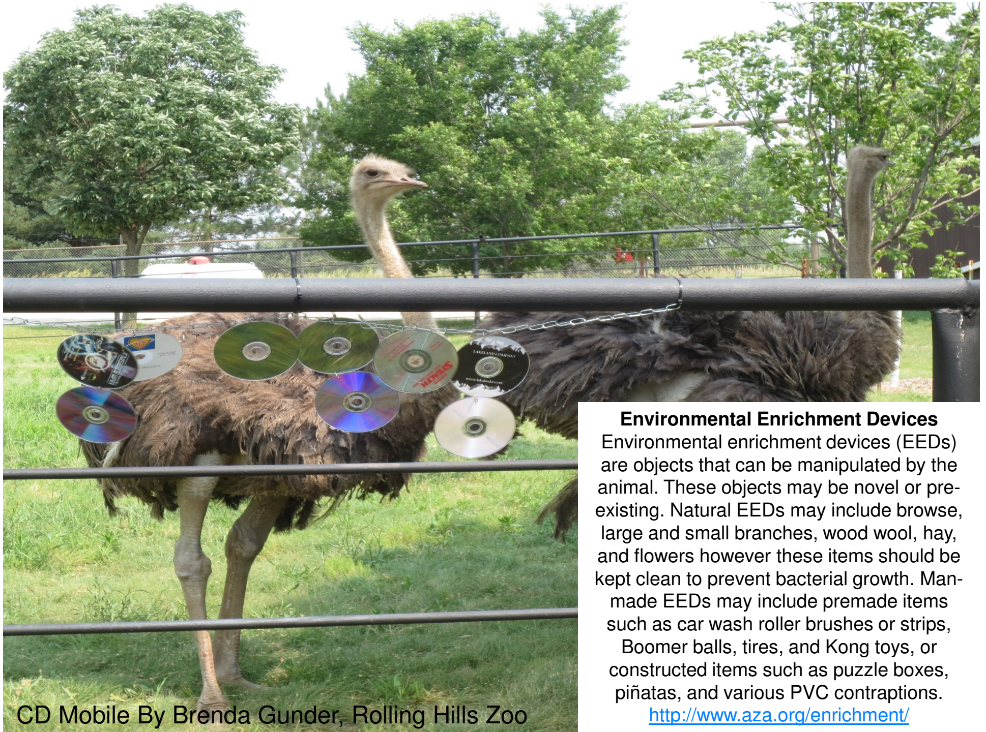
CD Mobile By Brenda Gunder, Rolling Hills Zoo