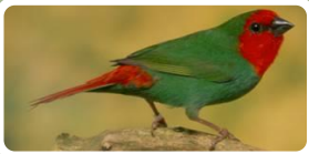
Red-throated Parrot Finch