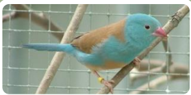
Blue-capped Cordon-bleu Finch