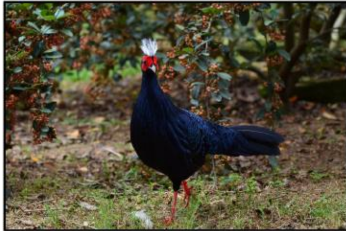
Male Edwards's Pheasant