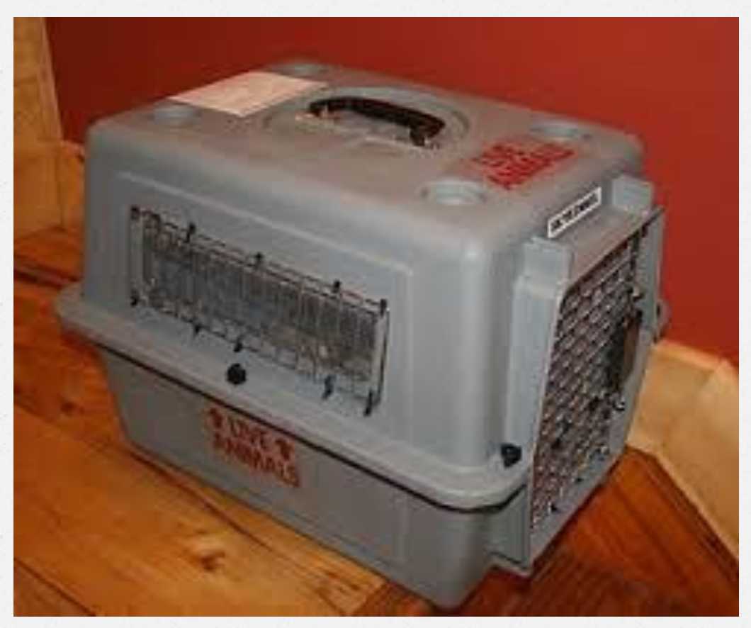
crate with plexi-glass over mesh