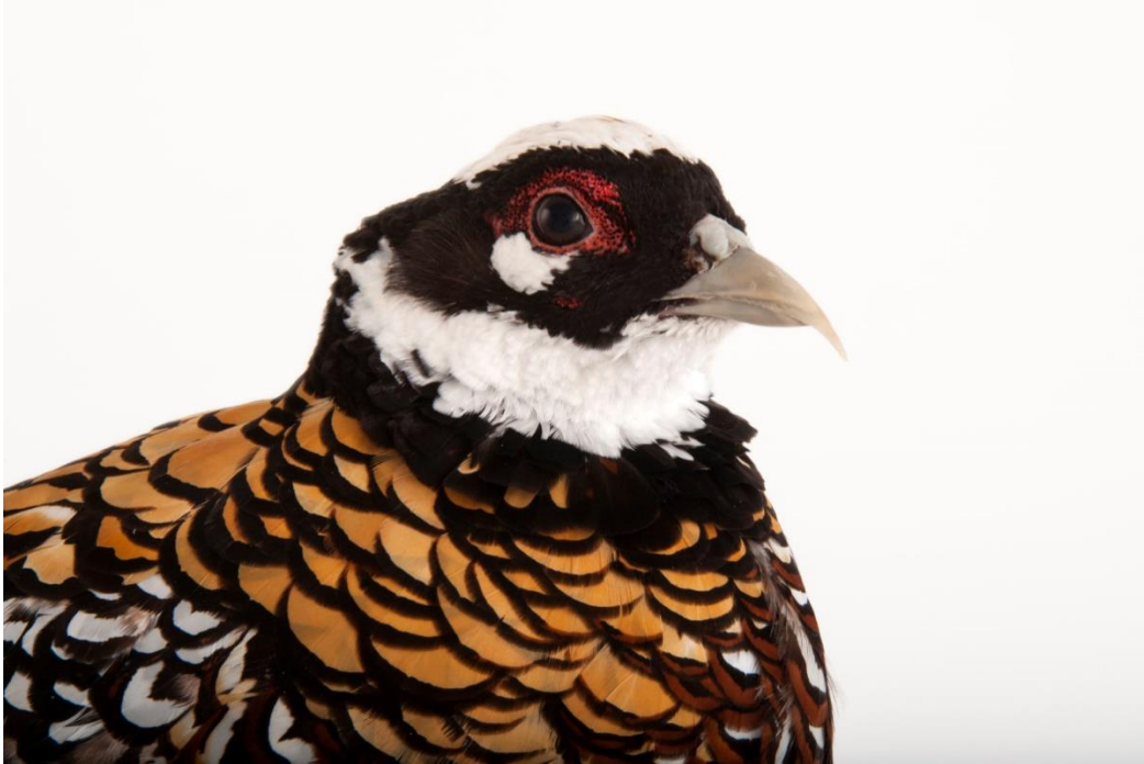
Reeve's Pheasant at Gladys Porter Zoo

If your institution supports a field project with one of these species, check if your conservation partner is observing the Reeve's Pheasant in their study/ field site. If your Zoo displays one of the following species, the addition of an aviary for the Reeve's Pheasant can illustrate the diversity of a biome at your institution and highlight a vulnerable bird.