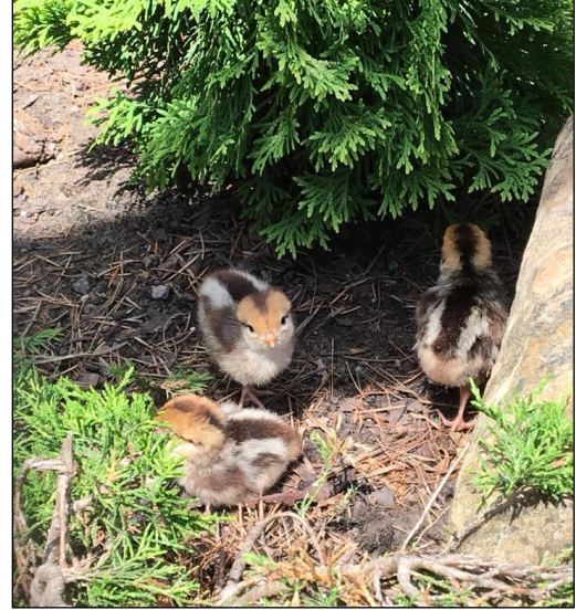
Reeve's chicks

AZA Connections: The following table is not a guide of what the Reeve's Pheasant can be housed with (although many of these are a possibility), but rather it is meant to show the range connections between other AZA recommended program species.