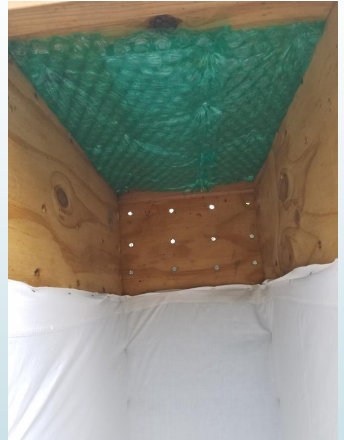
Bubbles on ceiling!