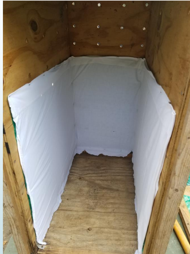
Soft cloth lining