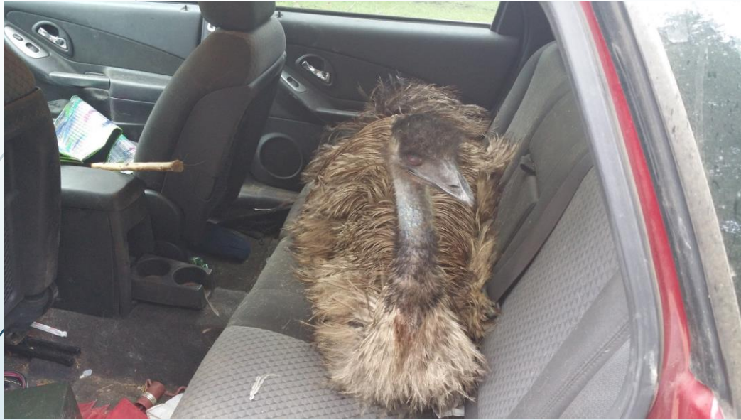
Apparently you can fit an emu in the back of a Malibu...