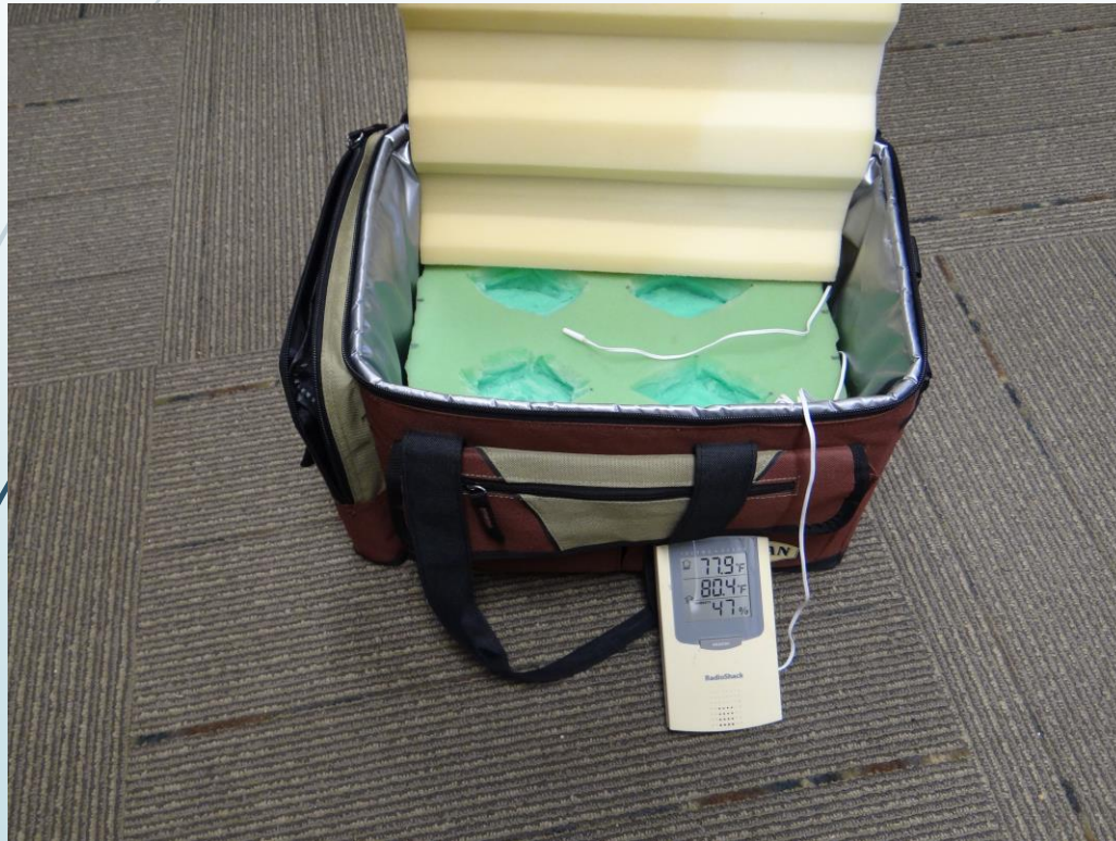
Transport as eggs