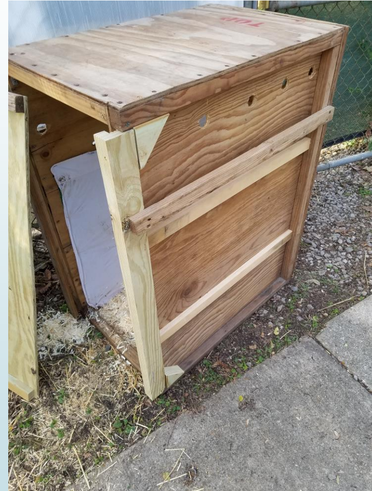
Complete with substrate