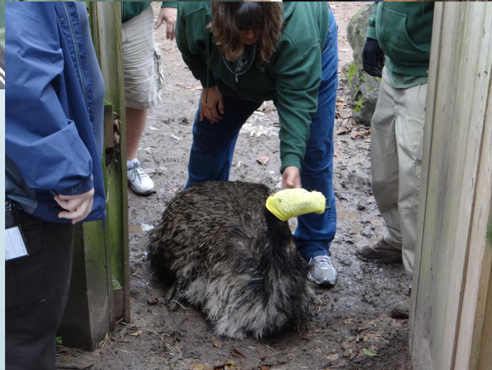
Male: Lifted from a sitting position.