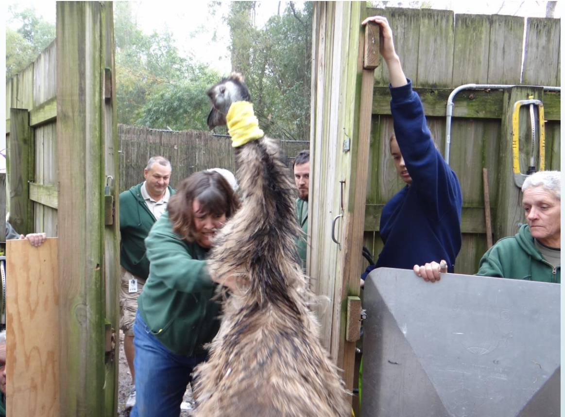
Female: Convinced to enter backwards while jumping.