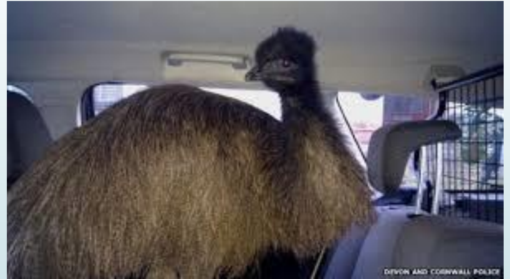
Or a cop car!