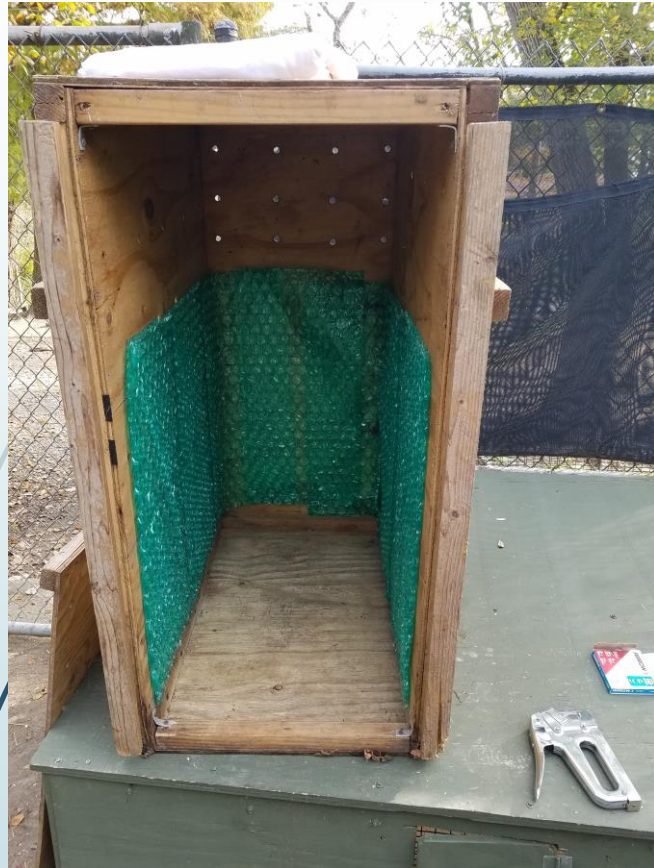
Bubble wrap on sides