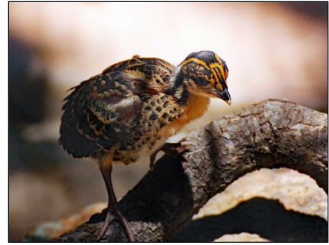
Crested Guineafowl chick

AZA Connections: The following table is not a guide of what the Crested Guineafowl can be housed with (although many of these are a possibility), but instead it is meant to show the range connections between other AZA recommended program species.