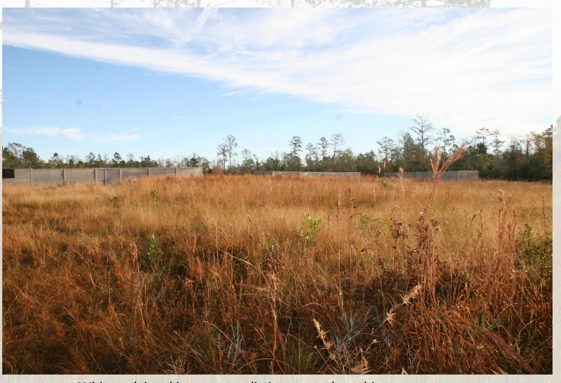
White oak is taking a naturalistic approach to this program.