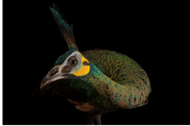
Green Peafowl hen

AZA Connections: The following table is not a guide of what the Green Peafowl can be housed with (although many of these are a possibility), but instead it is meant show the range connections between other AZA recommended program species.