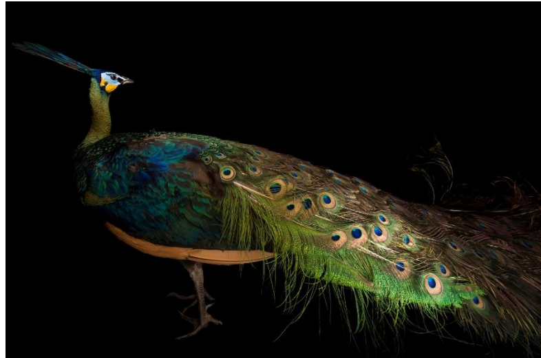
Green Peafowl male

Range: South-east Asia China, Lao People's Democratic Republic, Myanmar, Thailand, Viet Nam, and Indonesia (Java) Regionally extinct in Bangladesh, India, and Malaysia.