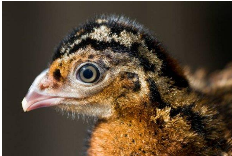
Helmeted Curassow chick