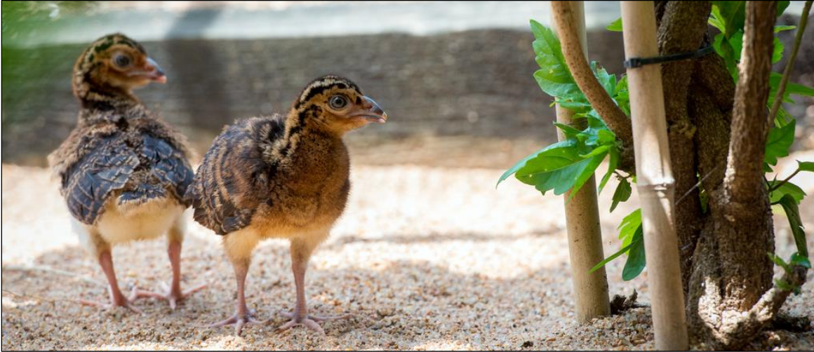
Helmeted Curassow chicks

If your institution is supporting a field project with one of these species, see if your conservation partner is observing the Helmeted Curassow in their study/field site. If your Zoo displays one of the following species, the addition of an aviary for Helmeted Curassow can illustrate the diversity of this biome at your institution and highlight an endangered bird.