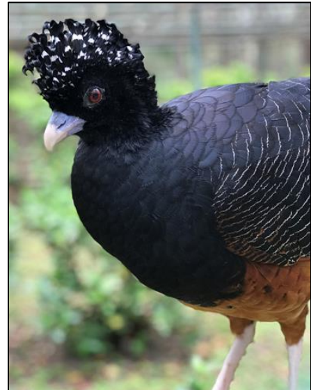
Blue-billed Curassow hen

Conservation Concern: The Blue-billed Curassow is considered critically endangered by the IUCN. Historically little has been known of the status of this species in the wild. Since being described to science in 1852, it has been noted as being rare. This species, like other curassows, is sensitive to habitat fragmentation and habitat conversion for agriculture. A recent and rapid conservation concern for this species has been the increase in palm oil agriculture in South America which has resulted in a loss of habitat for this already imperiled species.