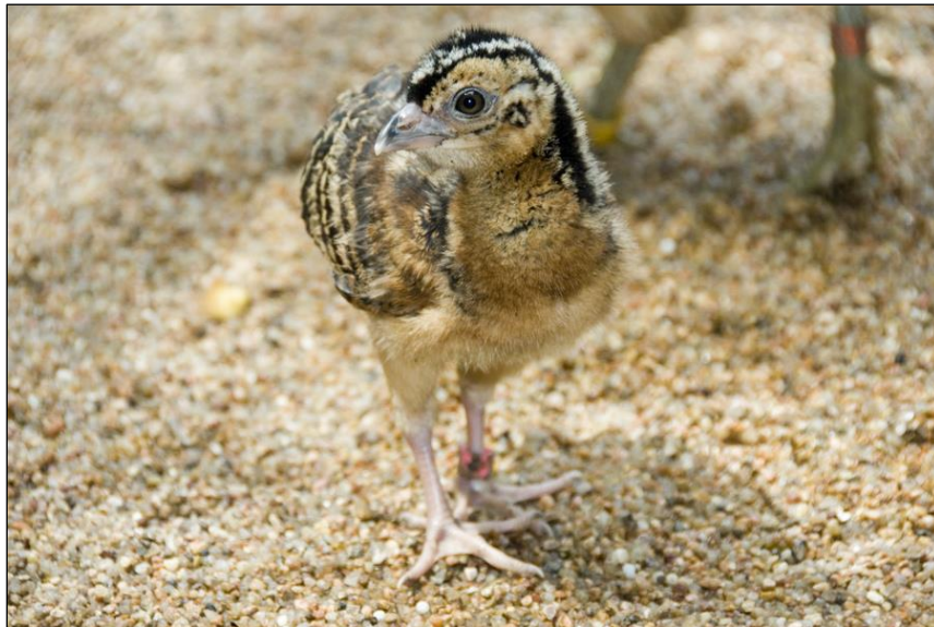
Blue-billed Curassow chick

If your institution is supporting a field project in Colombia with one of these species, if your conservation partner is observing the Blue-billed Curassow in their study/field site. If your Zoo displays one of the following species, the addition of an aviary for Blue-billed Curassow further illustrates the diversity of Colombia at your institution and highlights a critically endangered bird.