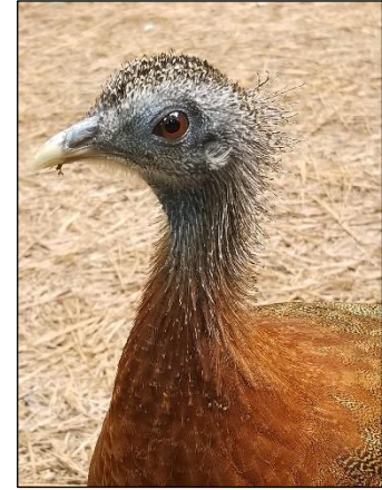
Female argus at Sylvan Heights Bird Park

AZA Connections: The following table is not a guide of what the Argus Pheasant should be housed with (although many of these are a possibility), but instead it is meant to show the connections between other AZA recommended program species.